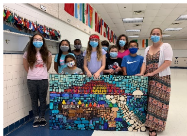
Mosaic created by Book Club students as part of the curriculum

This new curriculum was created for fourth through sixth graders and is being piloted as an after-school book club. The program uses art and literature as tools to progress through topics including identity, empathy, belonging, and cultural understanding . Team building exercises, journaling, and group discussions contribute to creating a cohesive community built on trust. Our desired outcomes for the program include increased self-awareness, empathy, and sense of belonging.